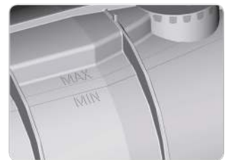
Transparent design enables easy visual inspection and fill verification